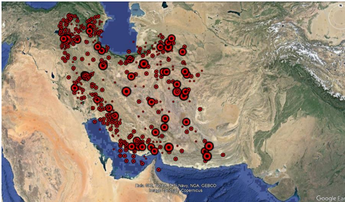
Figure 1: Recorded earthquakes 1900-1963