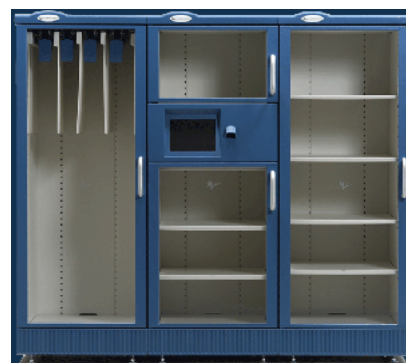
Fig. 1. iRISupply- RFID solution

This explains the main processes using RFID technology in medical cabinets. Medical industries and hospitals are in need of a device that monitors the supplies and expensive equipment such as pacemakers, stents, drugs etc [4]. iRISupply is designed to meet the needs of the medical industries and reduce the inventory cost by eight to twelve percent.