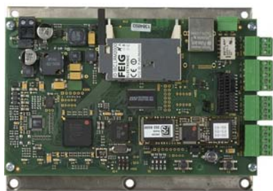
Fig. 2. Reader module

The hardware of the iRISupply consists of PCB designing of the boards and antennas used in the cabinet. These PCB's are designed with the Eagle application. Secure controlled storage units are accessible only by authorized users. The authorized users have an RFID tag on their ID and when the ID is scanned on the scanner attached to the cabinet, it detects the user and the status of the Cabinet. A touch screen console is designed to provide quick and easy end user interaction. Adjustable shelving to accommodate a variety of packaging sizes and shapes is provided in the Cabinet. Re-configurable Cabinets to adapt to changes in inventory mix. Dynamic shelving organization and location as all items are located through RFID. Lighting inside the Cabinets to enhance visibility to all items within storage is provided by the light boards designed with LED's.