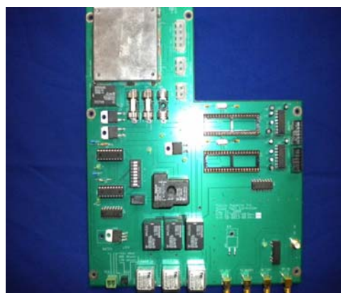
Fig. 5. PCB of Main Controller

The Main Controller performs the function of communication, control and command scheduling onboard the ROV. It is a PC 104 architecture-based rugged computer with Intel 386 as its core processor. It has a stack comprising power supply a motherboard and a multi-serial card [11].