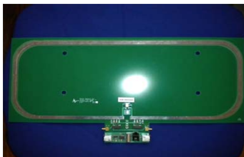
Fig. 4. PCB of RFID Antenna

In a preferred embodiment, the loop antenna and the Figure eight antenna are arranged about a common axis, referred to as the X-axis. The Figure eight antenna is placed symmetrically within the loop antenna.