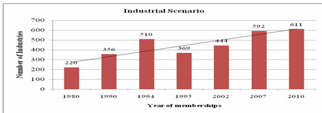
Fig. 1. Industrial Spectrum at Vitthal Udyognagar Industrial estate

Rotated Matrix: There are various methods of rotations. The method of rotation used is varimax, which is the most commonly used rotation method in factor analysis. The variance explained by each component after the varimax rotation method and the number of factors extracted based on Eigen value 1 and more, total variance explained is 64.0130%, the variables associated with four factors are grouped (see appendices, table 6).