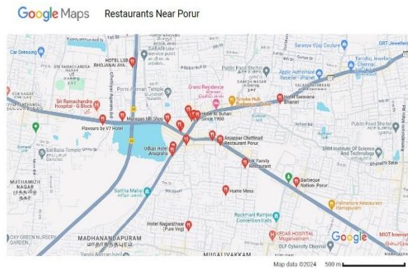
Fig. 1. Restaurants around porur

densely populated residential area, boasting a plethora of thriving restaurants in its vicinity. Figure 1 is a representation of the Google map showcasing the restaurants in Porur. The ability to provide online food delivery services is imperative for the sustenance of most restaurants. However, the primary challenge faced in the realm of online business pertains to logistics. It is essential to analyze delivery zones to accurately determine delivery distances thoroughly. Ensuring timely delivery and maintaining food quality standards are pivotal for the success of restaurants. Business proprietors often grapple with issues related to vehicle allocation and delivery services. Timely delivery emerges as a pivotal factor influencing customer retention rates. Hence, establishing a successful food delivery business necessitates implementing an effective strategy in vehicle allocation. In our study, the choice of delivery vehicle remains flexible, tailored to specific criteria such as distance, congestion, and order size. While bikes excel in dense urban areas for short distances, scooters and motorcycles offer greater speed and coverage. Cars are preferred for longer distances or larger orders, often utilized by major delivery services like Uber Eats. Vans are utilized for bulk deliveries or when transporting substantial quantities of food. Thus, the selection of vehicle is contingent upon various factors to ensure efficient and effective food delivery.