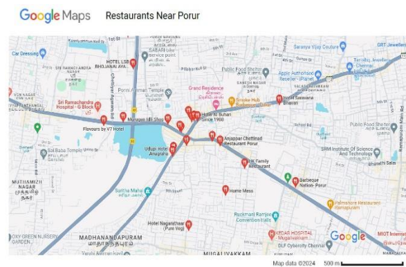
Fig. 1. Restaurants around porur

densely populated residential area, boasting a plethora of thriving restaurants in its vicinity. Figure 1 is a representation of the Google map showcasing the restaurants in Porur. The ability to provide online food delivery services is imperative for the sustenance of most restaurants. However, the primary challenge faced in the realm of online business pertains to logistics. It is essential to analyze delivery zones to accurately determine delivery distances thoroughly. Ensuring timely delivery and maintaining food quality standards are pivotal for the success of restaurants. Business proprietors often grapple with issues related to vehicle allocation and delivery services. Timely delivery emerges as a pivotal factor influencing customer retention rates. Hence, establishing a successful food delivery business necessitates implementing an effective strategy in vehicle allocation. In our study, the choice of delivery vehicle remains flexible, tailored to specific criteria such as distance, congestion, and order size. While bikes excel in dense urban areas for short distances, scooters and motorcycles offer greater speed and coverage. Cars are preferred for longer distances or larger orders, often utilized by major delivery services like Uber Eats. Vans are utilized for bulk deliveries or when transporting substantial quantities of food. Thus, the selection of vehicle is contingent upon various factors to ensure efficient and effective food delivery.