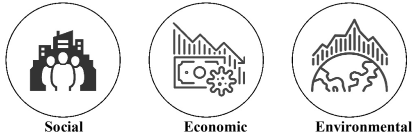
Fig. 2. Sustainable dimensions

A generic sustainability dimensions are depicted in Figure 2.