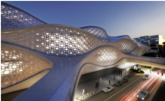
Fig3. Zaha Hadid separates space by texture and this usage of textile influences lighting