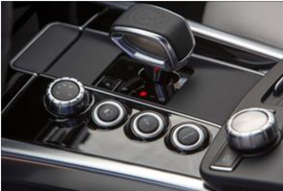
Fig5. Proper usage of texture prevents fingers form slipping