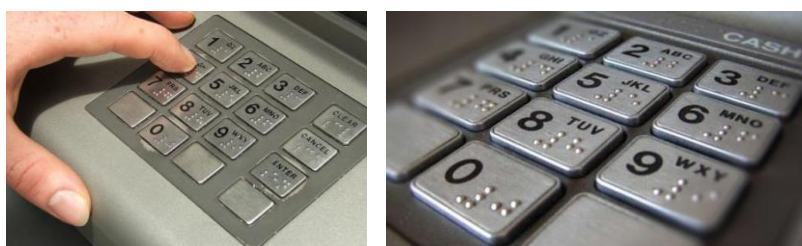
Fig1. Texture applied to ATM for blind person

• Another reason in choosing texture patterns for a product is given personality to it. Deciding on a texture pattern for a product can be carried out in a way that attributes the product to a particular group of people or reminds a specific lifestyle (Figure 2-4).