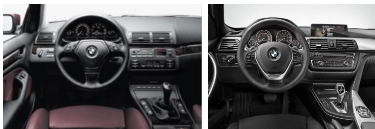
Fig8. The 2000 BMW 325i interior (left) and 2013 BMW 325i interior (right)

Shou yuan (2014) certified that most car manufacturers are making great efforts in designing and promoting In-Vehicle Information System (IVIS), which combines traditional car functions with internet radio, social-networking communication and other forms of internet connection. One of the most compelling illustrations of IVIS is the big screen based navigation system. If you compare two same model cars (BMW 325i) from 2000 and 2013(Figure 8), you will clearly notice that the biggest difference between the interior of these two cars is an 8-inch LCD display screen - not only for basic GPS-based map navigation, but also to easily access and display driving information (e.g., real-time traffic conditions, weather conditions, and place of interesting).