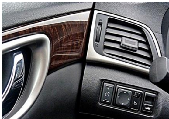
Fig7. Applying texture on interior components decreases glossiness, which leads to a vivid vision when looking at the buttons