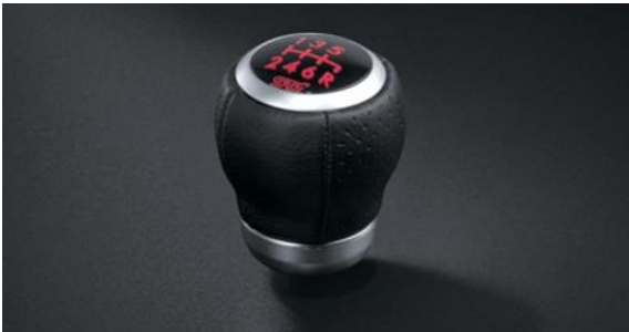
Fig6. Applying texture on interior components decreases glossiness, which leads to a vivid vision when looking at the buttons