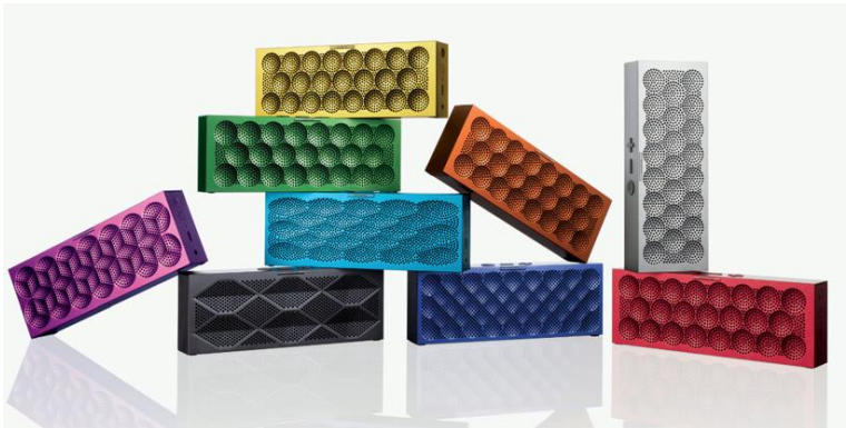
Fig4. In these speakers, texture is applied for functional reasons