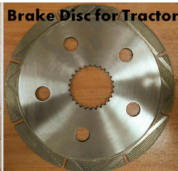
Brake Disc for Tractor