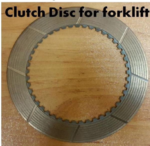
Clutch Disc for forklift