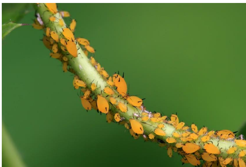
Figure 1. Aphids on a host plant

Aphids are small sap-sucking insects, and members of the superfamily Aphidoidea [18]. As one of the most destructive insect pests on cultivated plants in temperate regions, Aphids have fascinated and frustrated man for a very long time. This is mainly because of their intricate life cycles and close association with their host plants and their ability to reproduce with and without mating [19]. Fig. 1 shows some aphids on a host plant.