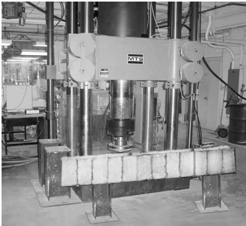
Fig.1 Test Set-up

concentrated load acting at mid-span, as shown in Fig 1.