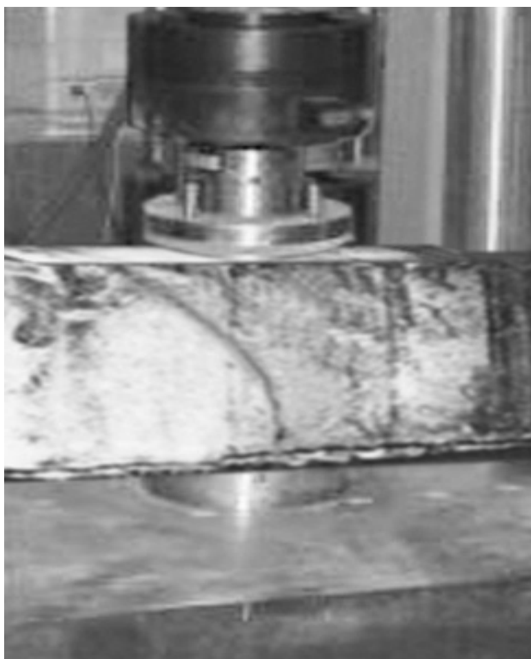
Fig. 4 Shear Failure of Beam with GFRP