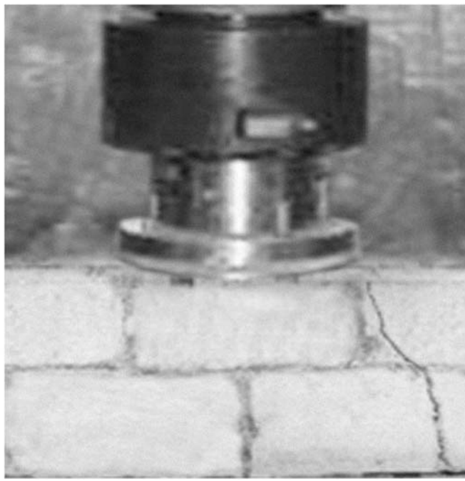
Fig. 3 Shear Failure for Beam Tests