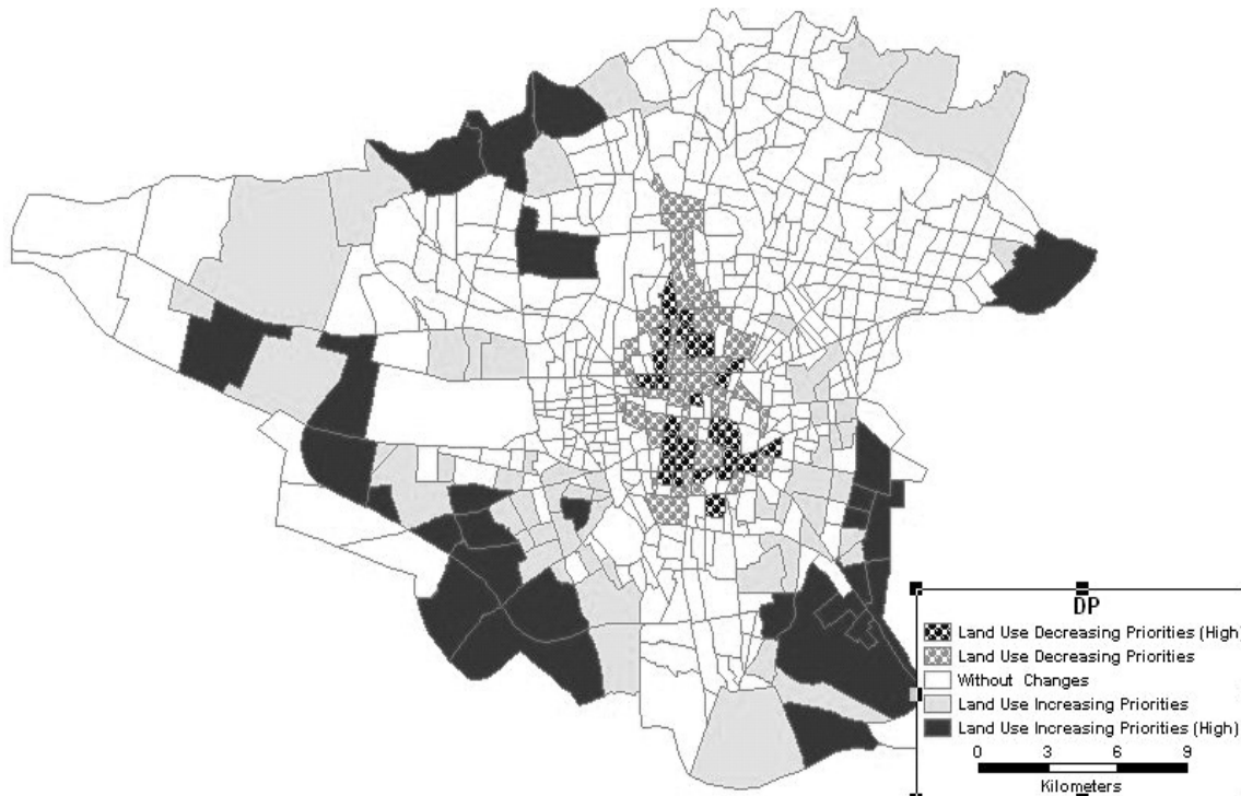
Fig. 4 Idealized Residential Land Use Priorities for Tehran TAZ.