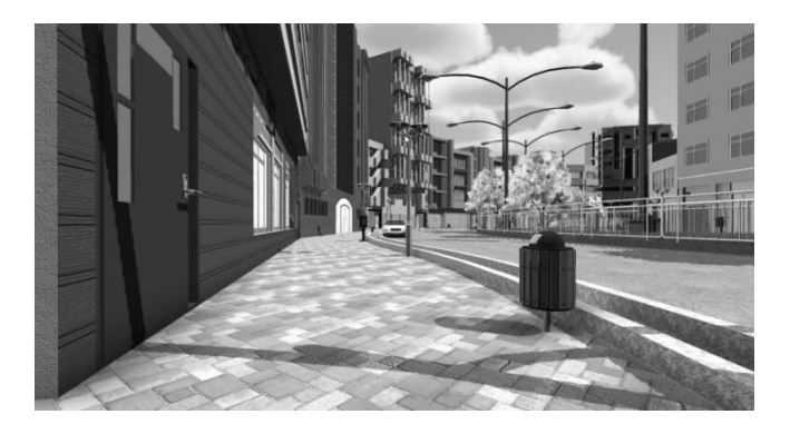
Fig. 2 Creating realistic virtual environments through visualization measures

more realistic. If in urban simulations, for example, displayed virtual environments do not look dynamic and vibrant through the movement of their elements (such as cars), they will not be able to convey the feeling and experience of a realistic urban space to observers. In this regard, measures such as adding human personage (characters) with expected movements in urban spaces, simulating natural movements of cars on roads being tested and providing natural movement for elements and details in the environment (such as flags, trees and grass in the median strip) help the urban space looks more natural. In fact, these events can enrich the individuals' perception virtual environment and contribute of the to generalizability and reasonability of results [11].