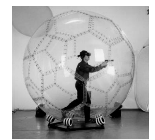
Fig. 4 Using a Virtusphere can create high levels of immersion in virtual environment.

Indeed this tool can simulate the participant physical movements in different directions and with various rhythms (such as walking, running, jumping, etc.). On the other hand, because of its sphere form, the user can navigate along an indefinite length. Hence according to these features, virtusphere can be used in urban design researches for analyzing and investigating users behavior, perception and movement desires in urban spaces.